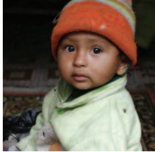
Ansara Family Fund page 4