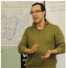
Hyde Square Task Force page 7