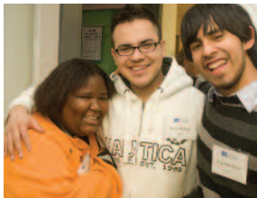
Environment Grants page 9